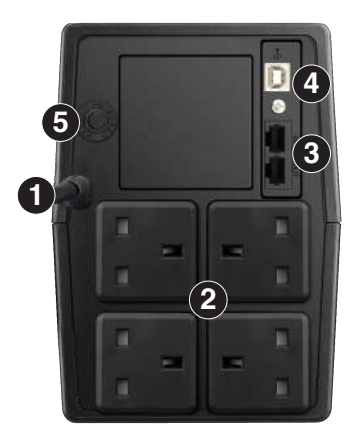
PowerTank P1000T / P1250T