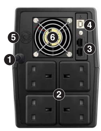
PowerTank P1500T / P2000T

4. USB Port (Optional) 5. Circuit Breaker 6. Cooling Fan