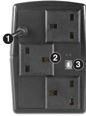
PowerTank F P800P