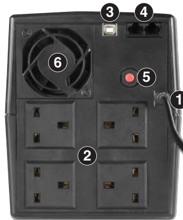
PowerTank F 1000P - 2200P