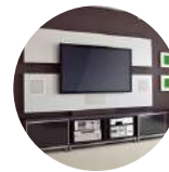
Home Theatre System