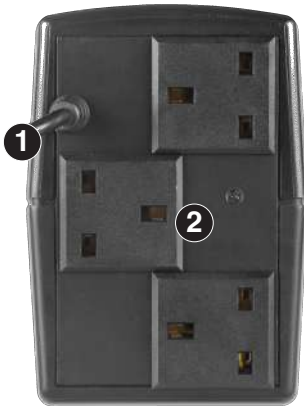
PowerTank F 1000E