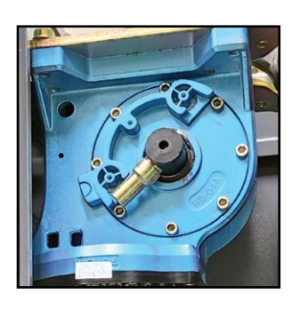
New Barrier Technology With using the latest barrier technology DC Brushless Motor , provide more stable and reliable operation.

The Ranger DC Brushless 770S Series Barrier can be used to manage and maintain several entry points at the same time, both locally and remotely, ensuring the full functionality of accesses in every type of location such as car parks, shopping centres, resident, hotel, hospitals, airports and railway station as well as all others type of small or large public facility.