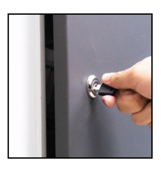
Pratical The manual release is easy, intuitive and protected by a personal key.