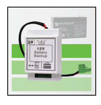
Battery Backup Battery charging with module above when power on the battery will automatically charge.