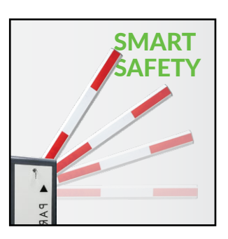
Smart Safety Built-in delay auto-closing and reverse on obstacle in case of resistance.