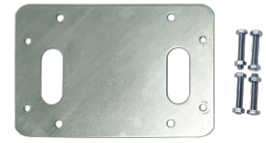
Base Plate (Optional)