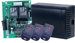
Transmitter & Receiver