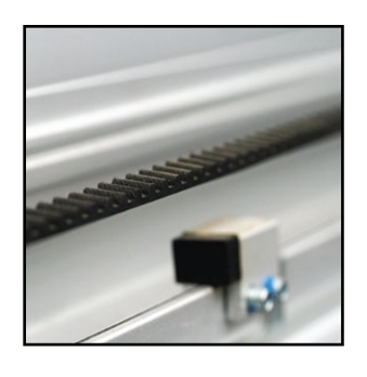
Reliability High reliability synchronous belt, drive door foward and backward with help of hanger.