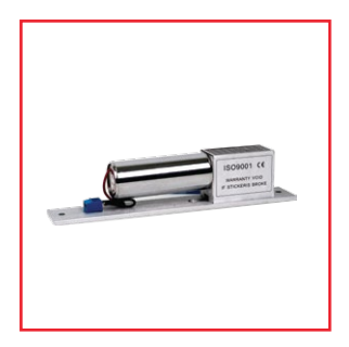
Drop Bolt Lock