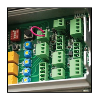
Built-in Control Unit Easy adjust sliding door precision move according door size & weight.