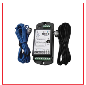
Safety Beam Sensor