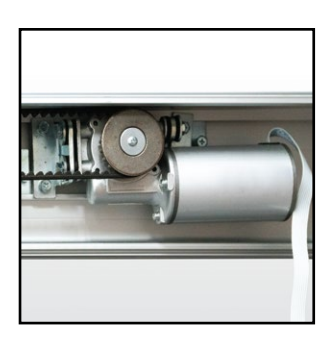
Heavy-duty Motor Adopting heavy-duty brushless motor with a long service life & larger torque.

Ranger automatic sliding door operator highly recommend for application at your living space, working environment etc to make your place more securely.