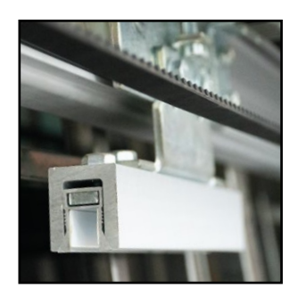
Stable Adjustable door hanger and clamp type door support even heavier glass door with smooth operation on the railway.