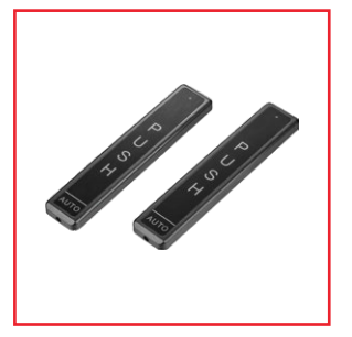
Wireless Push Button