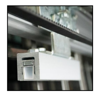
STABLE Adjustable door hanger and clamp type door support even heavier glass door with smoothly operation on the railway.