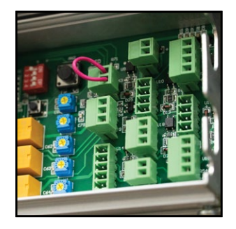
PRECISION Intuitive programming door controller to help precision moved and adjustable accroding door size and weight.