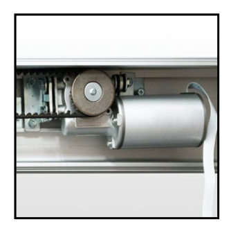
LONG LIFE DC Brushless and high-strength wear gears and high processing more stable, quiet, longer life, higher efficiency, larger torque.

The Ranger Heavy-duty Sliding Autodoor System integrated functional automation technology makes it an exceptionally stable, strong, silent and reliable operator contribute an excellence level of safety.