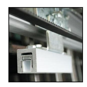
Stable Adjustable door hanger and clamp type door support even heavier glass door with smooth operation on the railway.