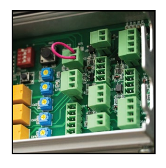
Built-in Control Unit Easy adjust sliding door precision move according door size & weight.