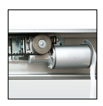
Brushless Motor Adopting brushless motor with a long service life & larger torque.

Ranger automatic sliding door operator highly recommend for application at your living space, working environment etc to make your place more securely.