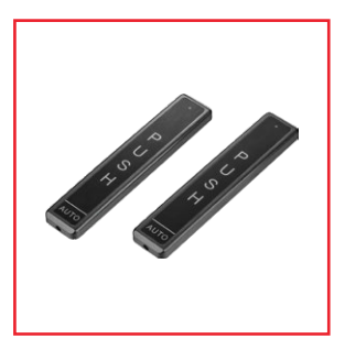
Wireless Push Button