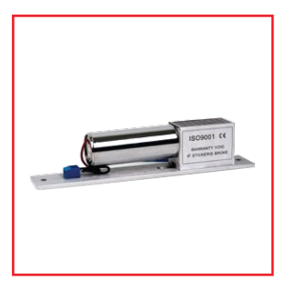
Drop Bolt Lock