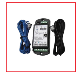
Safety Beam Sensor